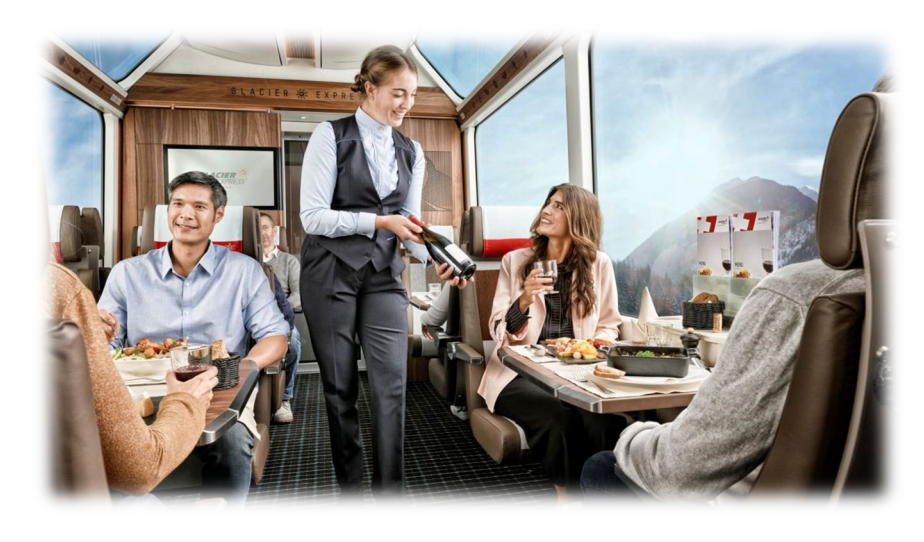
Link to the Glacier Express Experience

Offers a journey for the senses – from Engadine right to the Matterhorn. On its relaxing drive from dazzling St. Moritz to equally sophisticated Zermatt, the Glacier Express delights travellers with scenic attractions and technical state-of-the-art achievements. With its overhight panoramic windows, the Glacier Express opens up unobstructed views of unique landscapes.